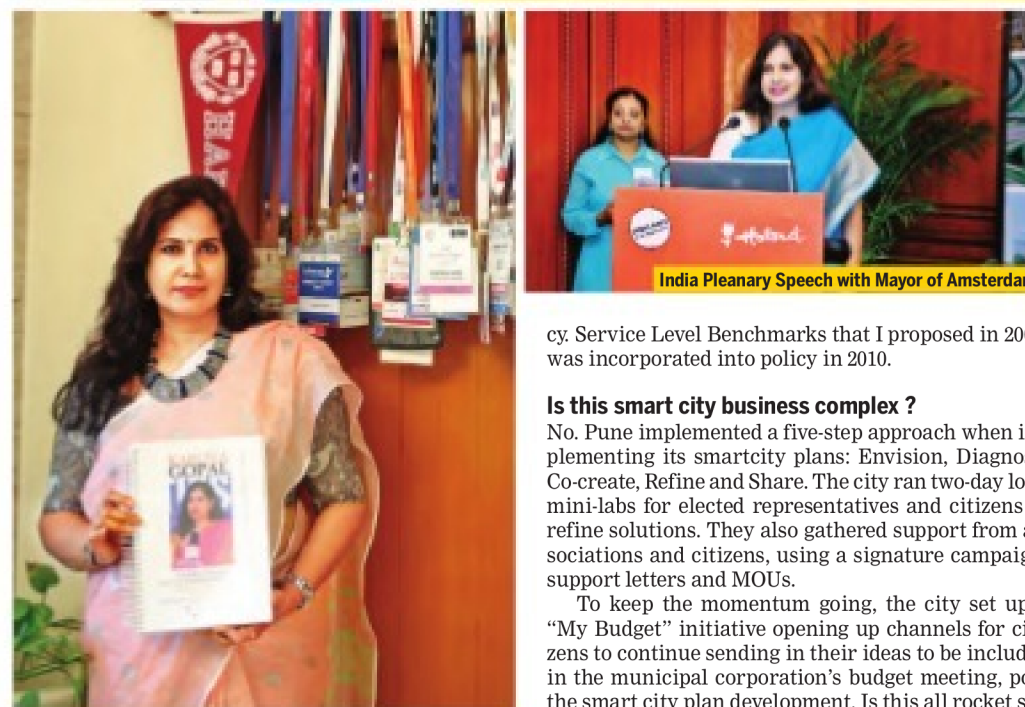
India Plenary Speech with Mayor of Amsterdam

ence? Can you give us an example of international cities that Hyderabad can follow?